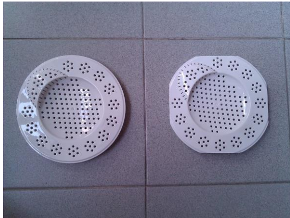
Fig 2. Cut to fit the floor trap

Step 1: Use an A4 size paper to cut a square hole template that match your existing floor trap.