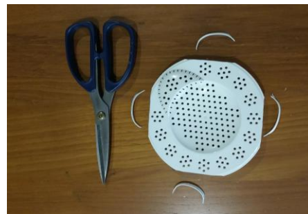
Fig 5. Cut to size