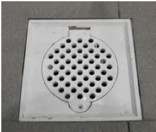
Fig 1. Floor trap with edges

For the floor trap with edges, modification of the Chokeless floor trap model number SS-010 is needed. Following are the steps.